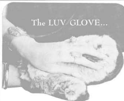
The LUV GLOVE...

I understand that these medals will be struck expressly for my account and I agree to pay for each medal promptly upon being invoiced on a monthly prepayment basis.